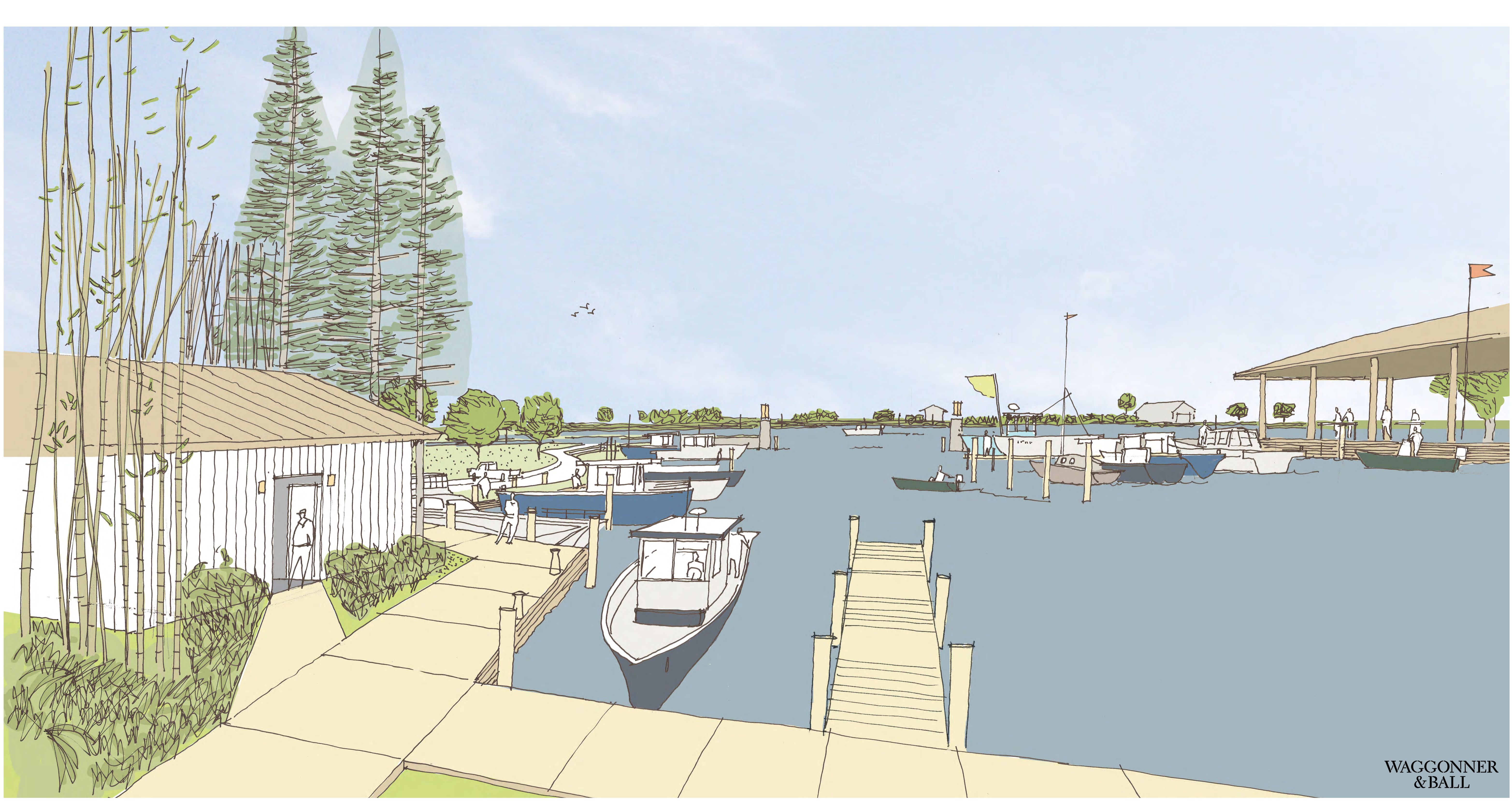
Prototype Perspective View