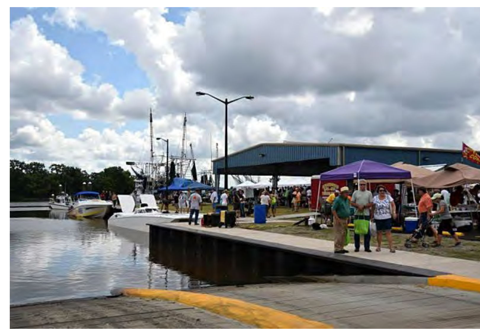
Precedent images of harbors of refuge and seafood markets