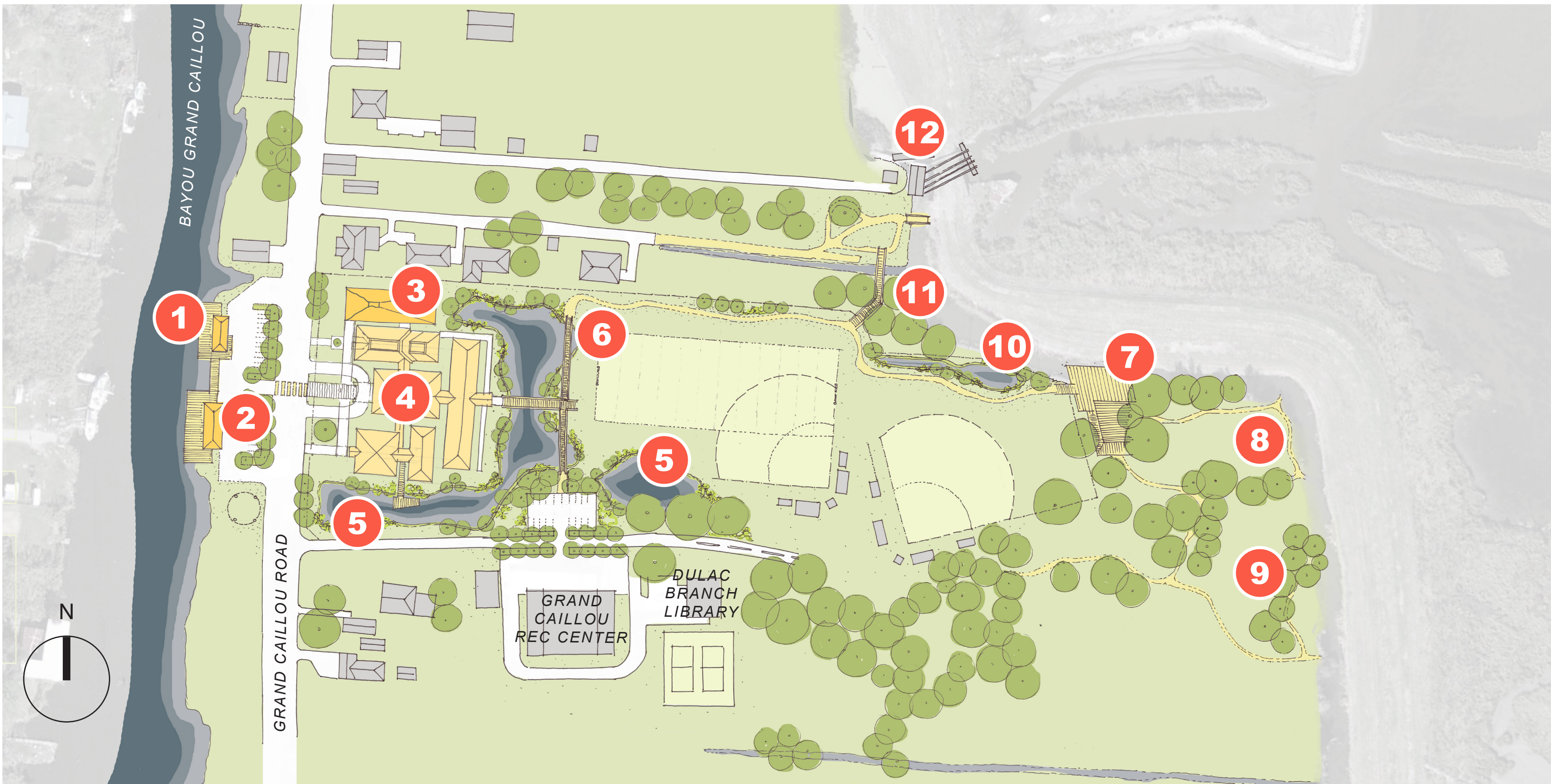
Plan of Project Proposal