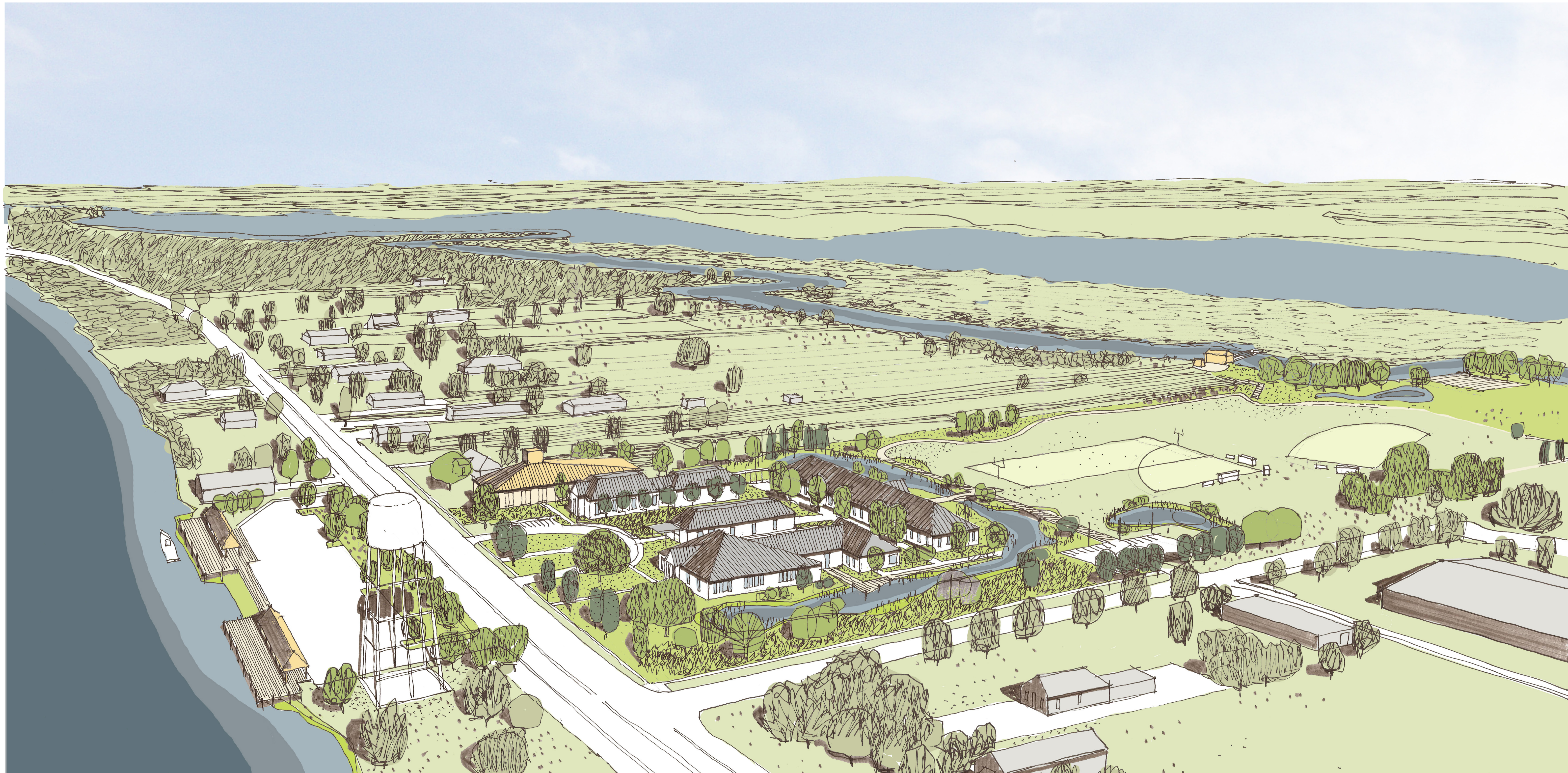
Aerial View Looking North