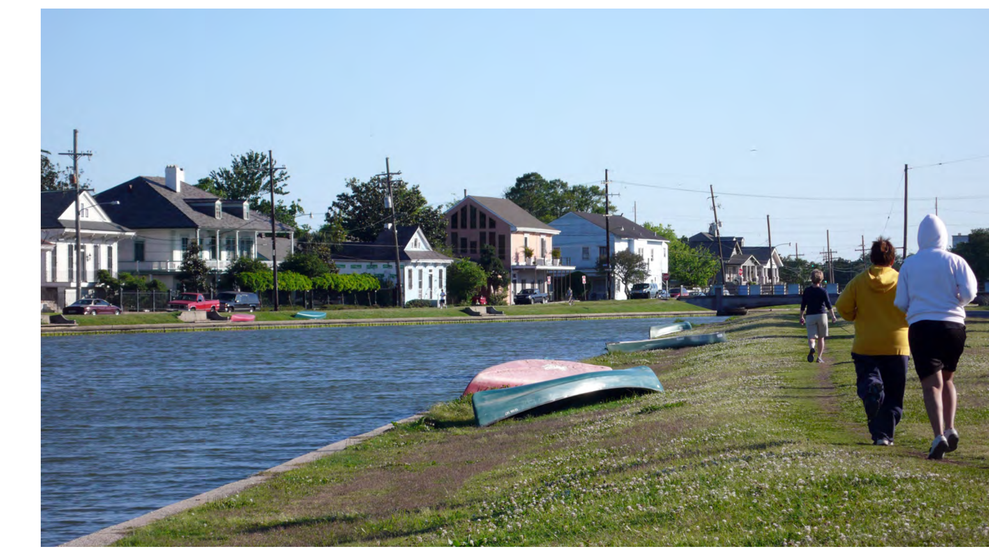
Precedent image of pathway along waterway