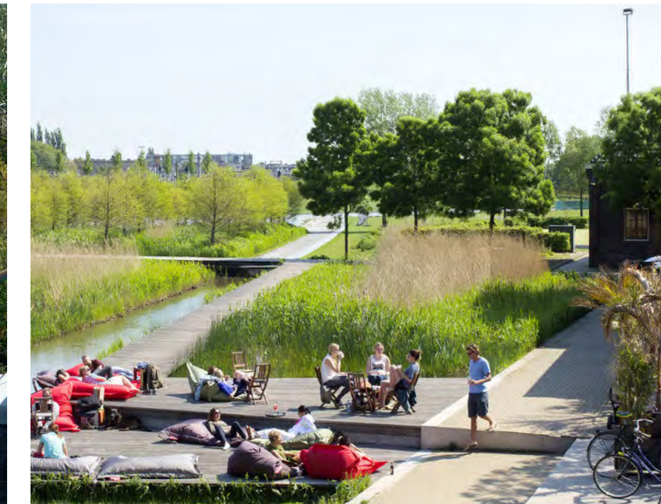
Precedent images of paths, boardwalks, and crossings in a wetland park