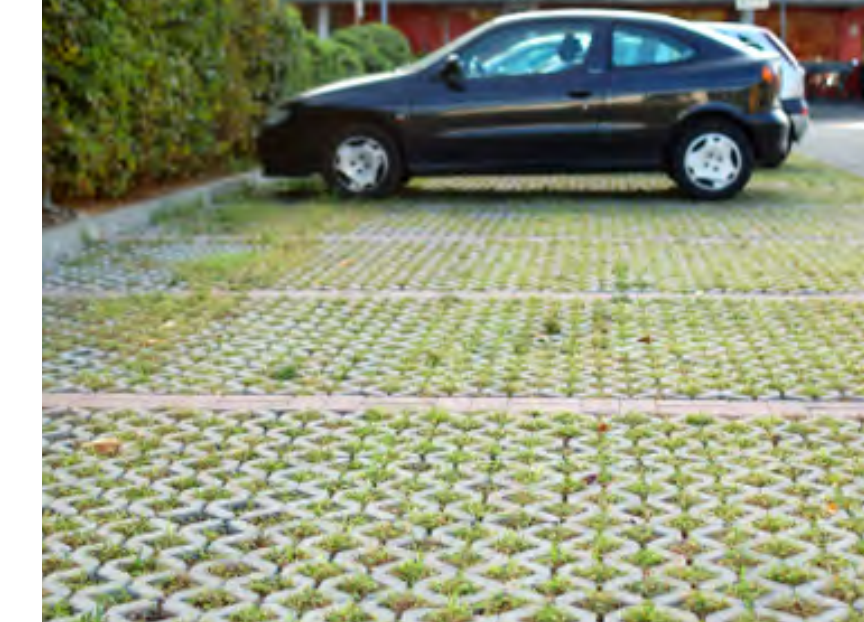
Precedent image of permeable parking