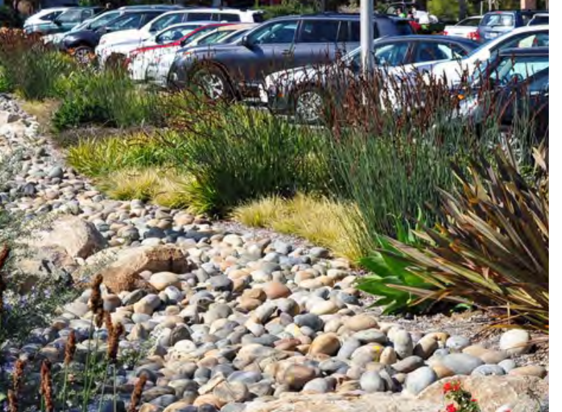
Precedent image of