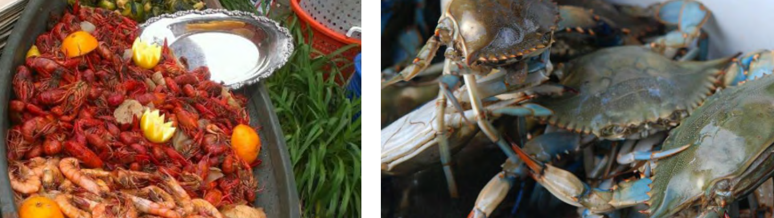
Precedent images of seafood market