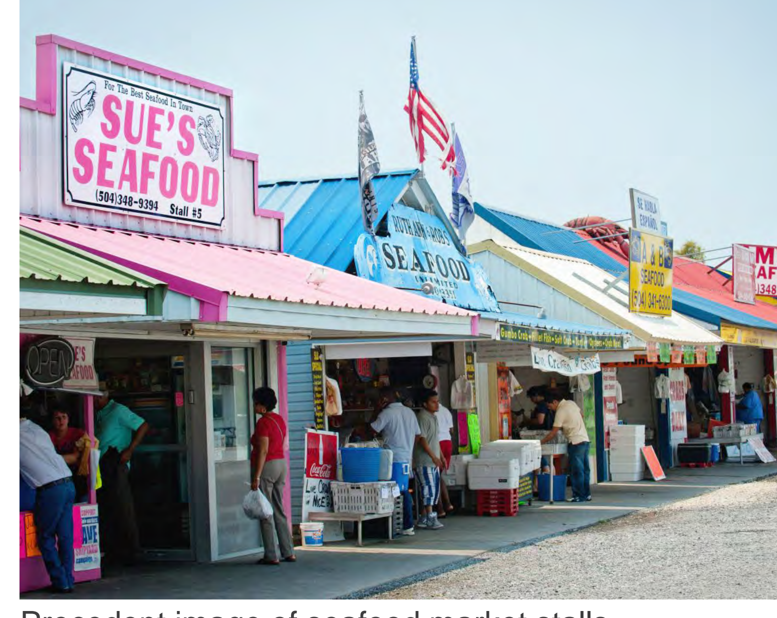
Precedent image of seafood market stalls Westwego Fish Market